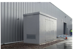
21) COMPRESSOR/ GENERATOR NOISE REDUCTION