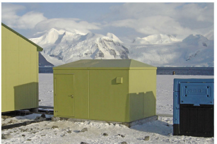
4) THERMAL INSULATION ANTARCTICA