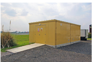
22) LIGHTING CONTROL AIRPORT AIR SIDE