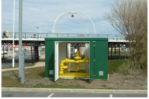
17) GAS GOVERNOR HOUSING