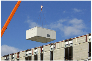
11) ROOF PLANTROOM PRE-ASSEMBLED