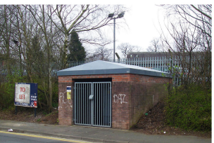
25) ROOF ANTI-VANDAL