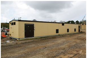
5) BOILER HOUSE RELOCATABLE