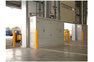
10) SAFETY CABINET PROTECTION