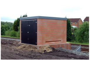
9) REC SUB STATION SIMULATED BRICK