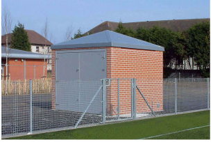
16) PLAYGROUND STORE ANTI-CLIMB PYRAMID ROOF