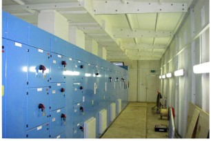
14) ENVIRONMENTAL CONTROL INTEGRAL AIR PLENUM