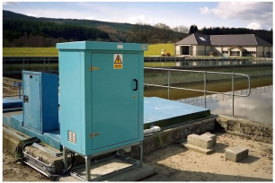
8) CONTROL CABINET BOTTOM ACCESS