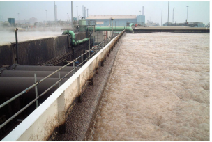
7) EFFLUENT CONTAINMENT CHEMICAL RESISTANT