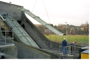
13) STRUCTURAL COVERS 25M SPAN