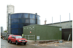
23) SPRINKLER PUMPS FIRE RESISTANT