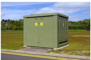
26) REC UNIT SUB STATION STANDARD DESIGN