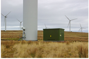
18) WINDFARM HIGH IP RATING