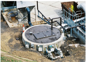
1) ODOUR CONTROL COVERS