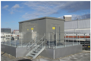
6) ROOF SUB STATION LOW MASS BI-FOLD DOORS