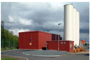
30) PROCESS PLANT LARGE FOOTPRINT