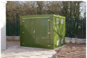
3) FIRE CONTAINMENT INTUMESCENT VENTS