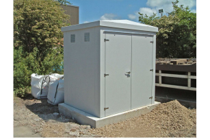
15) SWITCH KIOSK STAINLESS STEEL FITTINGS