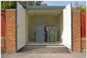
2) SUB STATION NOISE ATTENUATION