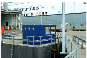
20) PERSONNEL PROTECTION MARINE ENVIRONMENT