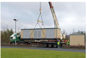
28) PRE-COMMISSIONED PLANT 20T LOAD-BEARING