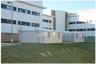
12) ISOTOPES STORES HIGH SECURITY