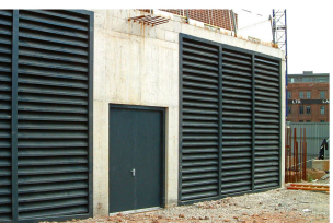
19) LOUVRES AND DOORS NON- CONDUCTING