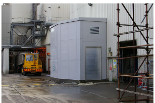
29) PROCESS PLANT BESPOKE SHAPE LOUVRE DOOR